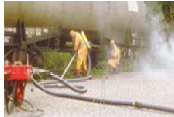
1979 Mississauga Chemical Spill