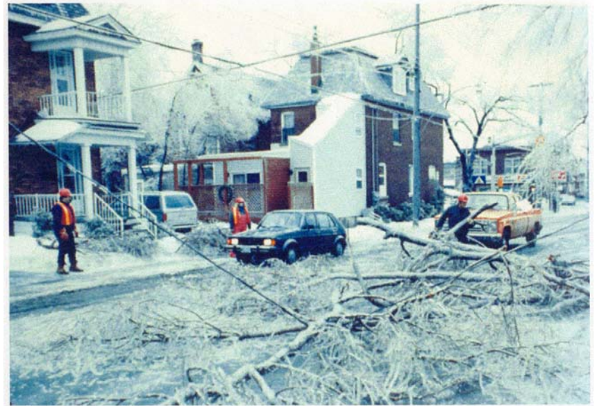
1998 Ice Storm